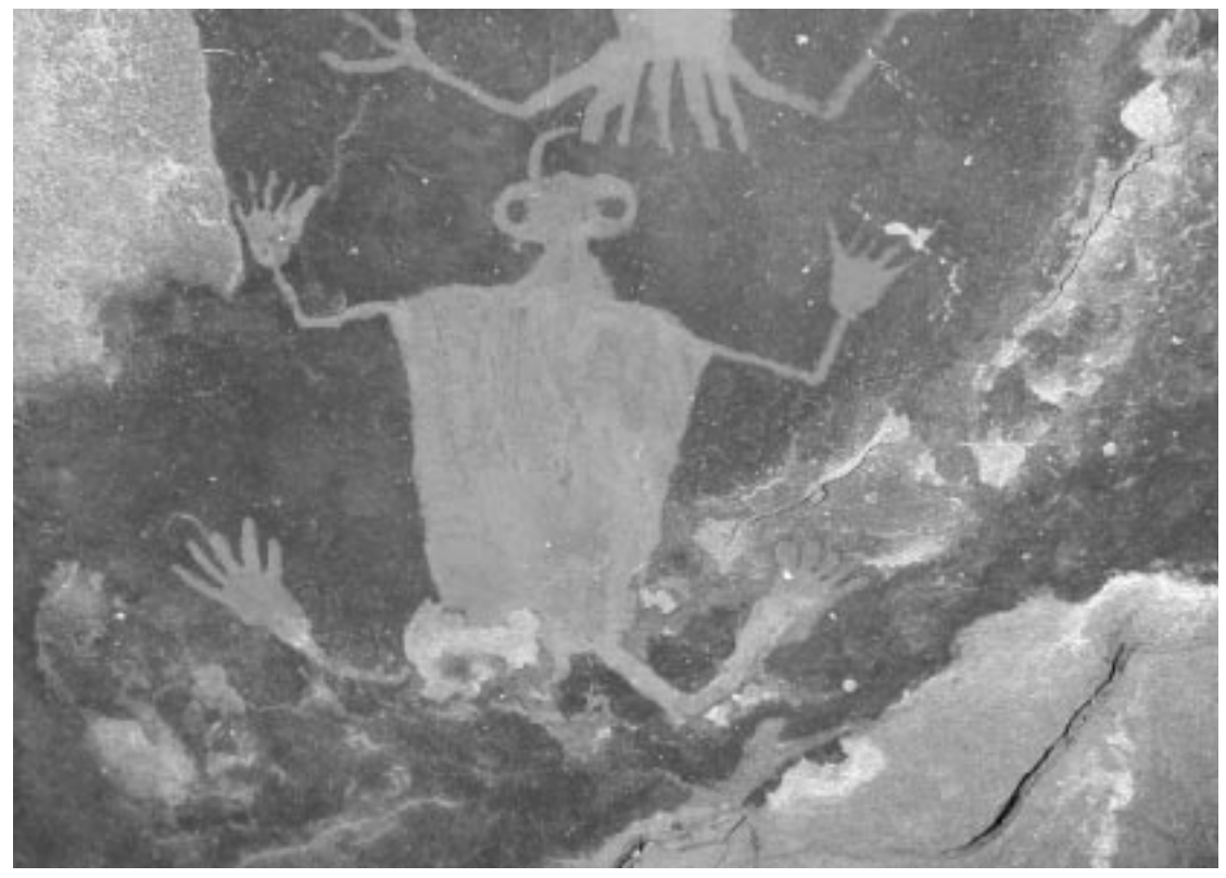
Rock art in Sierra Madre Archeological District, Los Padres National Forest.