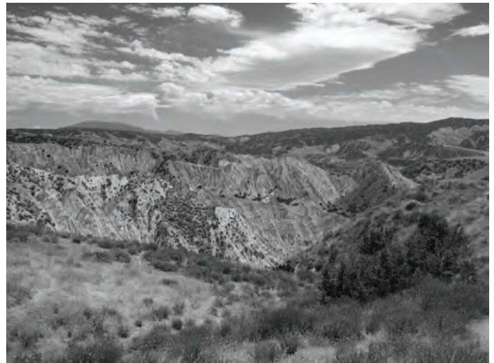
ForestWatch and rural landowners joined forces to protect the Rangeview Ranch, nestled between the Bitter Creek National Wildlife Refuge and the Los Padres National Forest.

Earlier this month, ForestWatch and rural landowners celebrated a tremendous victory after the federal Bureau of Land Management decided to withdraw more than 10,000 acres from a controversial oil lease sale.