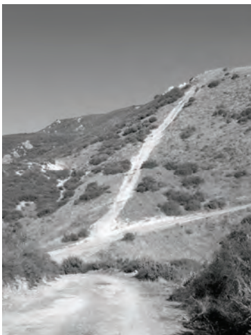
An illegal off-road vehicle trail scars a hillside on West Cuesta Ridge in San Luis Obispo County.