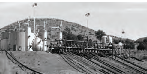
Oil development requires a network of roads, pipelines, storage tanks, transmission wires, and other infrastructure, threatening our wild landscapes.

ForestWatch argued that BLM failed to adequately study the damage caused by oil development, and failed to consult with expert wildlife agencies like the U.S. Fish & Wildlife Service. The lands supported endangered plants and wildlife like the California condor, San Joaquin kit fox, blunt-nosed leopard lizard, and California jewelflower.