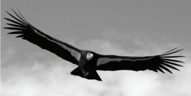
The endangered California condor is one of the world's most imperiled birds.

This April, ForestWatch learned that all appeals were denied. Now, the only option left to protect the forest is to take the agency to court. The drilling plan is so bad, and the legal violations are so severe, that we cannot stand by and allow oil drilling to expand into these fragile areas. The lawsuit will serve as the last line of defense between a clean, green forest and a forest littered with noise, runaway development, and a host of toxic chemicals. Stay tuned!