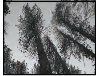
Ancient trees tower high above the forest floor on Mt. Pinos. The agency is proposing to log trees and clear vegetation across 3,570 acres here.

ForestWatch will continue its work to improve the plan.