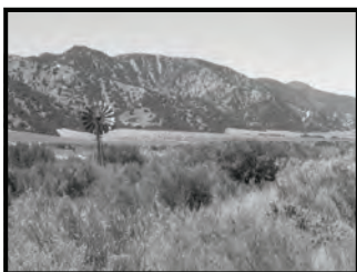
The BLM is auctioning several parcels of land in the Upper Cuyama River Valley along the national forest boundary.

FACT: According to the agency's own estimates, new oil drilling will produce less than a day's supply of oil at our current consumption rate. The Los Padres currently has 240 active oil wells and is already offering its fair share of oil to the nation.