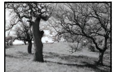
An oak savannah on Figueroa Mountain, near the Santa Ynez Valley.

Call us if you'd like to grant one of our holiday wishes!