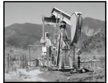
One of 240 oil wells in Los Padres, near the Sespe Wilderness and Sespe Condor Sanctuary (background).

estimates, new drilling in the Los Padres would yield just 17 million barrels of oil — less than a day's supply.