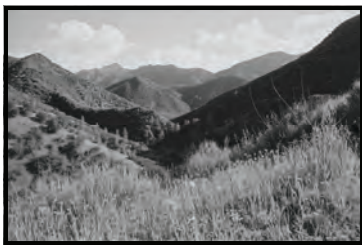
The San Rafael Wilderness, looking south towards the Lost Valley.