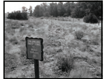
Renegade off-road vehicles have blazed an illegal trail through this mountain meadow on the Mt. Pinos Ranger District, and vandalized the fence.

ForestWatch is now working to reduce these threats across the forest.