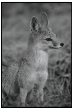
The new forest plan establishes guidelines to protect wildlife like the San Joaquin kit fox, threatened by oil development, urban encroachment, and grazing.