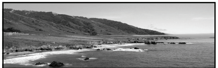
The Pacific Valley Unit of the Gorda Allotment, where numerous violations have repeatedly occurred during the last six years. A new plan allows grazing to continue in this sensitive area.

Cattle have previously damaged riparian habitat for steelhead along Prewitt and Plaskett creeks on the Gorda Allotment, and cattle can injure or kill