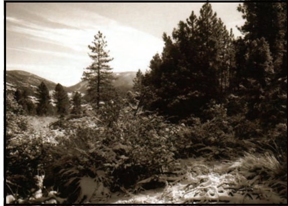
A winter storm transforms Mt. Piños into a snowy wonderland.

But if you're lucky, and find your own place of snowy solitude, it's hard to imagine this is southern California.