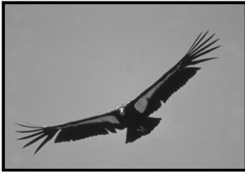
The California condor is the largest bird in North America, and one of the most endangered. There are only 57 condors in the Los Padres.