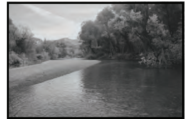
The Upper Santa Ynez River, near the confluence with Mono Creek.

Or, if you have a creative talent or expertise to offer, we might be able to put your skills to work on one of our special projects. We're currently looking for photographers, artists, GIS technicians, and other specialized skills.