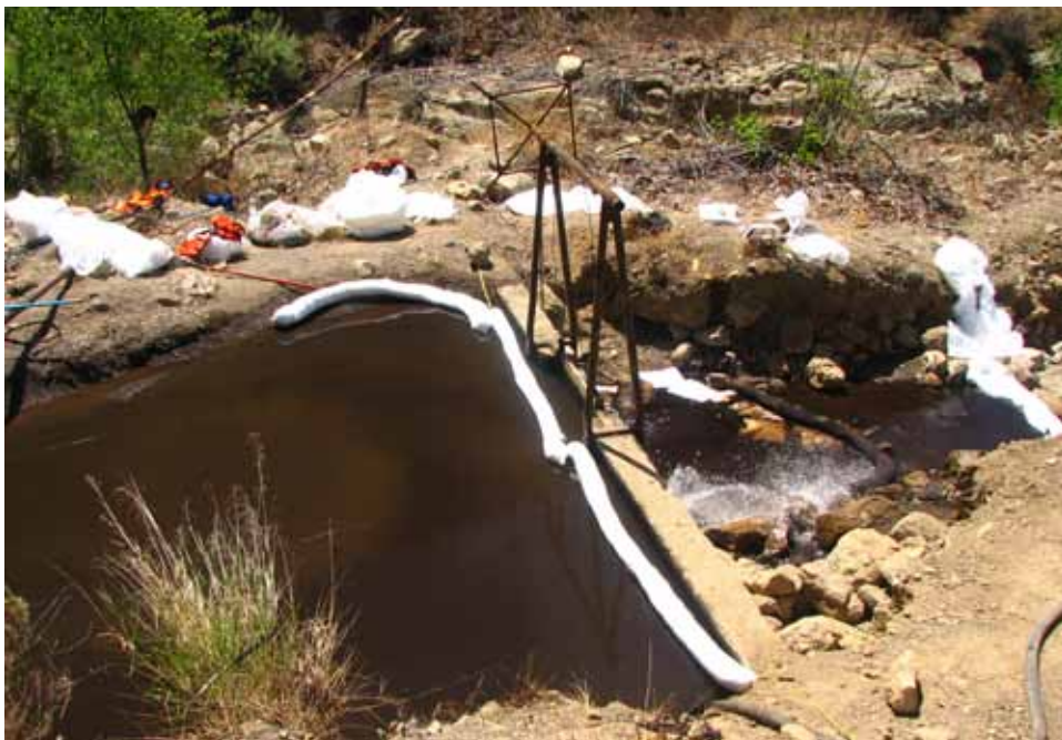
Cleanup efforts underway for an oil spill on a tributary of Sespe Creek in April

ForestWatch will begin a comprehensive evaluation of oil operations in the Sespe Oil Field. This evaluation will identify whether oil operations are properly permitted, whether they are in compliance with state and federal laws to protect clean air and water, and that adequate measures are put into place to prevent future spills in this ecologically sensitive area.