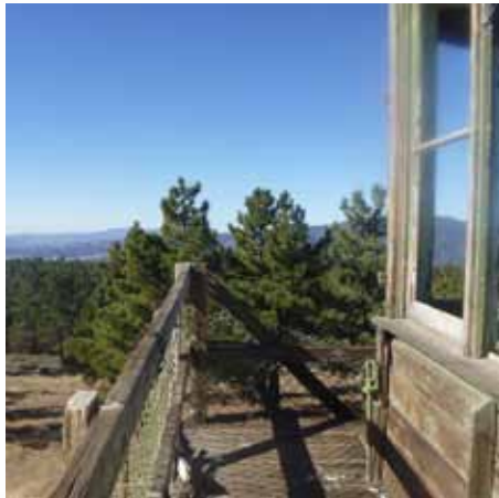
View from Frazier Mountain lookout

Volunteers got to work removing the trash, and when done a few hours later they had collected over 170 POUNDS from the site. The views from the tower were amazing (when we took time to look up from our task) and the weather could not have cooperated better (though it had snowed just 5 days prior!)