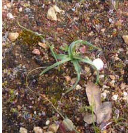
Camatta Canyon amole in March, prior to any flowers

The Camatta Canyon amole is a cute little endemic plant listed as a threatened under the Endangered Species Act (ESA). It only grows on a small piece of land in San Luis Obispo County (99% occurring on the Los Padres National Forest), making it quite rare and also quite vulnerable. Because of the importance of this area for the amole, it is protected as "critical habitat." The Forest Service established a Special Interest Area there in 2005, vowing to prepare a management plan to identify ways to best protect and restore the plant.